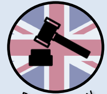
Rule of Law

We have had some meaningful discussions in our assemblies this month. Ask your child to tell you about the stories behind our assembly pictures and how they link to our British Values.