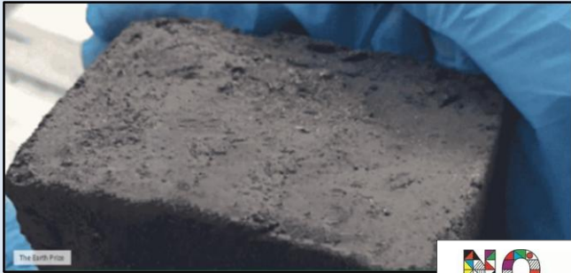
The Earth Prize