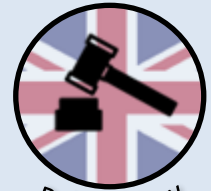
Rule of Law

We have had some meaningful discussions in our assemblies this month. Ask your child to tell you about the stories behind our assembly pictures and how they link to our British Values.