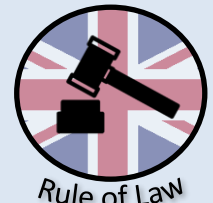
Rule of Law

We have had some meaningful discussions in our assemblies this month. Ask your child to tell you about the stories behind our assembly pictures and how they link to our British Values.